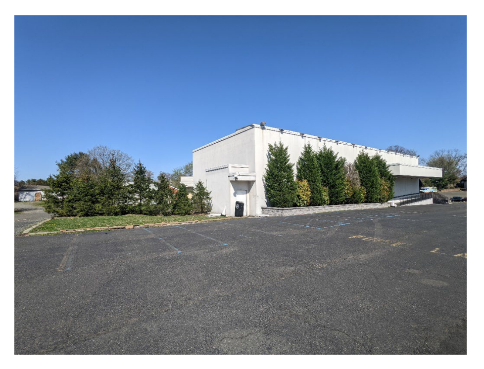
Figure 2 - Former Pure Nightclub Building

The neighboring R-7 Residential Zone permits single-family dwellings on lots with a minimum area of 7,500 square feet. The lot and development pattern on the nearby streets generally follows the prescribed lot size.