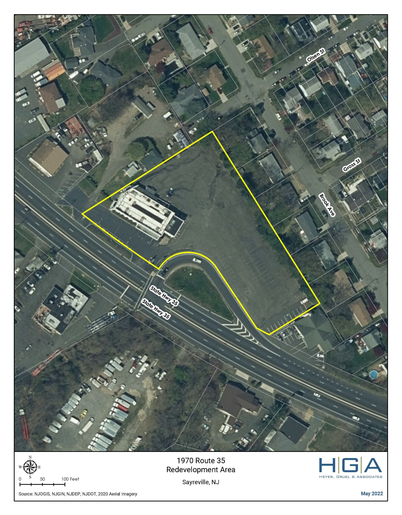
Figure 1 - Aerial Map (2020) of Redevelopment Area