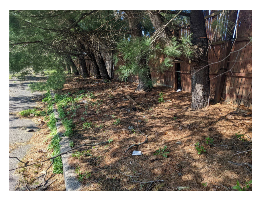
Figure 5 - Trees along the property line of Lots 6-11 in Block 425