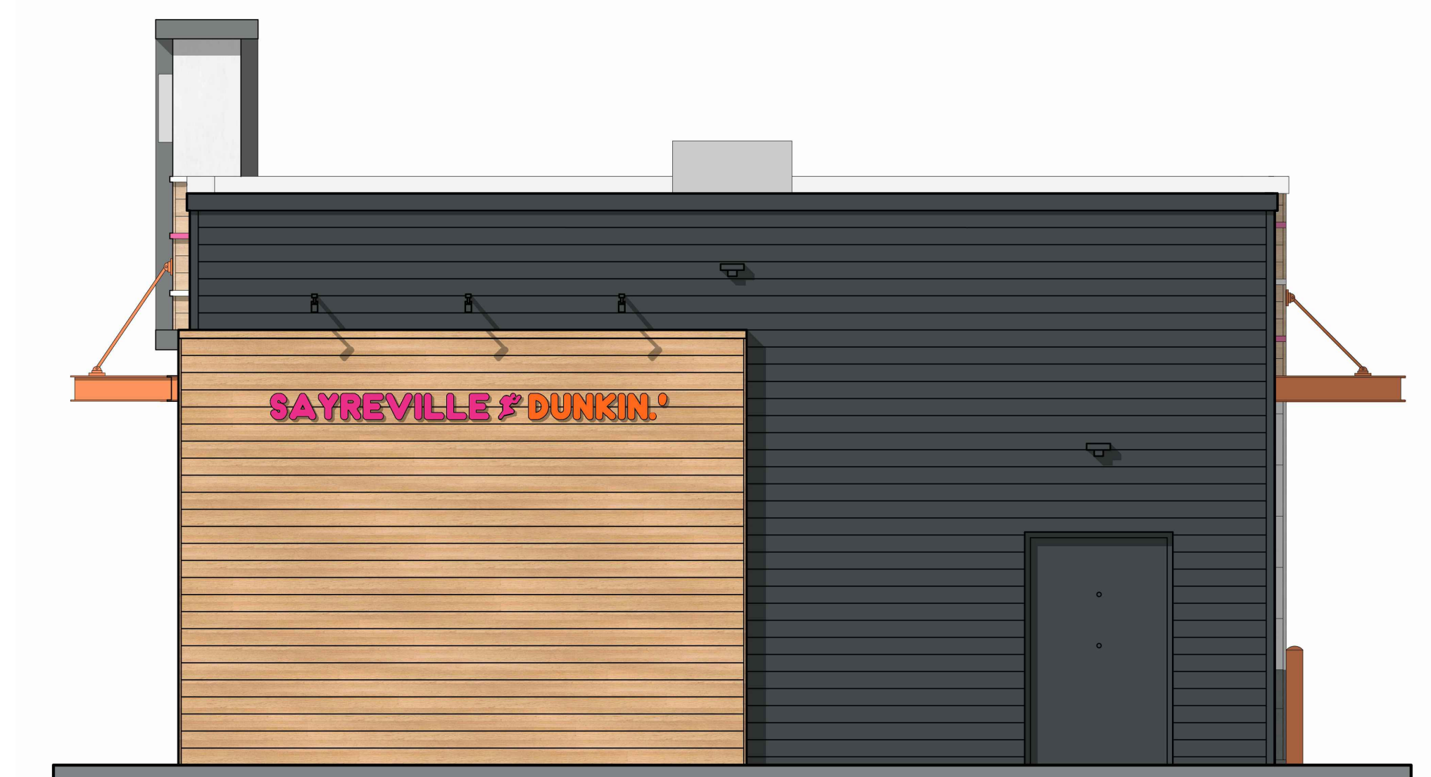
2 SOUTH ELEVATION NTS NOTE: