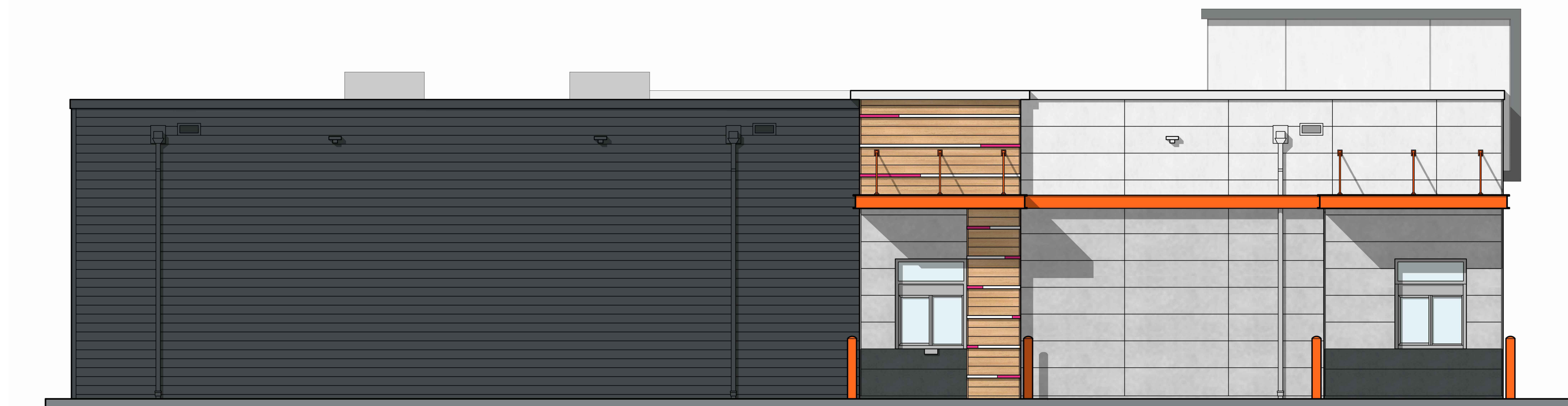
4 EAST ELEVATION NTS NOTE:

36 Arnes Avenue Rutherford, NJ 07070 Tel. 201.896.0333 Fax. 201.896.9469 email@gkanda.biz gkanda ARCHITECTS, PC Gary Kliesch and Associate Architects