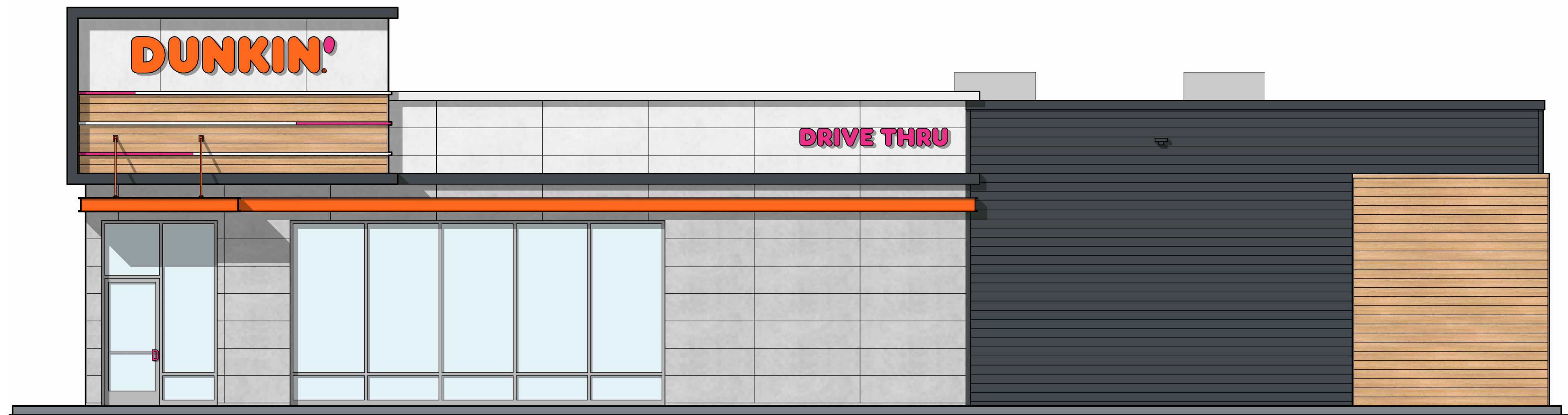
1 WEST ELEVATION (@ NORTH ERNSTON RD.) NTS NOTE: